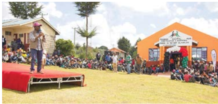
Waziri wa Habari, Mawasiliano na Uchumi wa Kidijitali, William Kabogo, akizungumza wakati wa uzinduzi wa vituo vipya vitatu vya kidijitali huko Wiyumiririe, Passenga na Mirangine katika eneo bunge la Ol Kalou, Kaunti ya Nyandarua.

majengo yaliyowekwa kompyuta na huduma za intaneti pekee. Ni vituo vya fursa ambapo vijana wanaweza kupata ujuzi wa kidijitali, kufanya ubunifu, kupata ajira za mtandaoni na kubuni suluhisho zinazoboresha maisha yao pamoja na jamii wanamoishi. Lengo letu ni kuhakikisha hakuna Mkenya anayesalia nyuma katika enzi ya kidijitali," alisema Bw. Kabogo. Vituo hivyo vitatu ni sehemu ya Mpango wa Kitaifa wa Vituo vya Kidijitali wa Serikali, unalenga kuziba pengo la kidijitali kwa kupanua upatikanaji wa intaneti ya gharama nafuu, mafunzo ya ujuzi wa kidijitali, maeneo ya ubunifu pamoja na huduma za kidijitali za Serikali. Kupitia mpango huo, maelfu ya vijana wanatarajiwa kupata ujuzi unaohitajika ili kushindana katika soko la kimataifa la kidijitali linalokua kwa kasi. Vikiwa vimeanzishwa kupitia ushirikiano kati ya Wizara ya Habari, Mawasiliano na Mfuko wa Maendeleo ya Maeneo Bunge (NG-CDF), vituo hivyo vitatoa huduma za matumizi ya kompyuta, intaneti ya kasi na mafunzo ya ujuzi wa kidijitali.