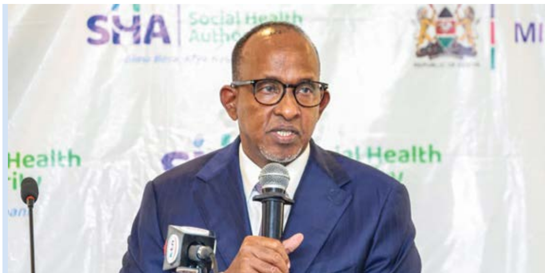
Waziri wa Afya Aden Duale akizungumza jijini Nairobi alipoongoza kongamano la mashauriano la ngazi ya juu lililowakutanisha vyama vya watoa huduma za afya, Mamlaka ya Afya ya Jamii (SHA), Wakala wa Afya ya Kidijitali (DHA) na wadau wengine wa sekta hiyo.

Wizara ya Afya imeanza mchakato wa kuhamisha huduma kutoka Mfumo wa Watoa Huduma wa Mamlaka ya Afya ya Jamii (SHA Provider Portal) kwenda Mfumo mpya wa Usimamizi wa Taarifa za Afya wa SHA (SHA HMIS), hatua inayoweka msingi muhimu katika juhudi za Kenya kuimarisha huduma za afya za kidijitali chini ya mpango wa Taifa Care. Waziri wa Afya, Aden Duale, aliongoza kikao cha mashauriano cha ngazi ya juu kilichowaleta pamoja vyama vya watoa huduma za afya, Mamlaka ya Afya ya Jamii (SHA), Wakala wa Afya ya Kidijitali (DHA), pamoja na wadau wengine wa sekta hiyo kujadili mkakati wa mpito huo. Kikao hicho kilijikita katika kupitia mfumo wa uhamishaji wa huduma, ratiba ya utekelezaji, utayari wa watoa huduma za afya, pamoja na ramani ya utekelezaji wa mfumo huo kote nchini. Washiriki pia walijadili changamoto zilizowasilishwa na watoa huduma za afya na kukubaliana kuhusu hatua zitakazohakikisha mpito huo unafanyika kwa urahisi bila kuvuruga utoaji wa huduma za afya.