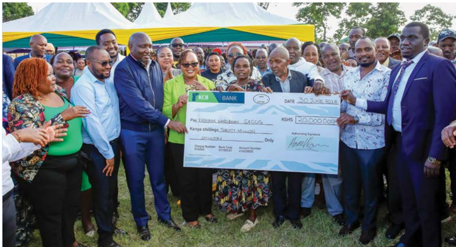
Gavana wa Kaunti ya Kirinyaga Anne Waiguru, pamoja na viongozi wa vikundi vya jamii na viongozi wengine wa Kirinyaga, waonyesha mfano wa hundi wakati wa utoaji wa fedha za uwezesaji kwa Saccos za mashinani.