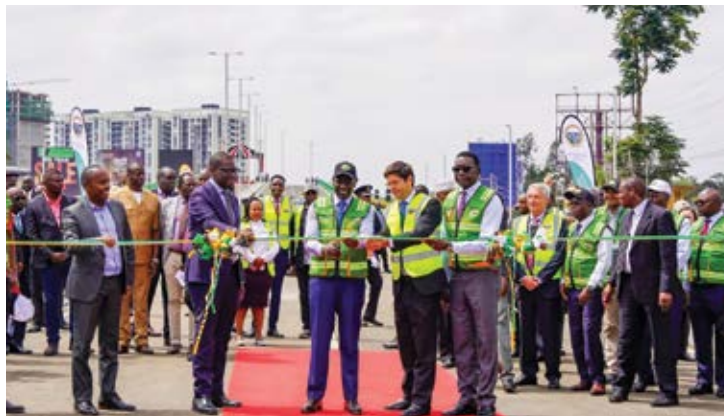
Rais William Ruto (akikata utepe) anazindua daraja la juu la Barabara ya Ngong-Barabara ya Naivasha lenye thamani ya Sh3.8b jijini Nairobi.

Rais William Ruto ameizindua rasmi barabara ya juu (Flyover) ya Ngong Road–Naivasha Road yenye thamani ya Shilingi bilioni 3.8, hatua inayoweza alama muhimu katika juhudi za kuboresha mfumo wa usafiri wa Jiji la Nairobi. Barabara hiyo ya juu yenye urefu wa mita 820, iliyotekelezwa na Mamlaka ya Barabara za Mijini Kenya (KURA), imejengwa ili kuondoa moja ya maeneo yaliyokuwa yakisababisha msongamano mkubwa wa magari jijini, na hivyo kuboresha usafirishaji wa watu na bidhaa katika mojawapo ya njia zenye shughuli nyingi zaidi za usafiri jijini Nairobi. Mradi huo unatarajiwa kupunguza msongamano wa magari kwa hadi asilimia 60, jambo litakalopunguza kwa kiasi kikubwa muda wa safari, gharama za usafiri na kuboresha usalama barabarani. Kwa miaka mingi, madereva wamekuwa wakikumbwa na ucheleweshaji mkubwa katika eneo hilo, lakini barabara hiyo mpya ya juu inatarajiwa kutoa afueni kwa kupunguza msongamano na