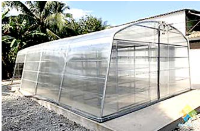
Kikaushio cha sola ambacho hutumia miale ya jua kukausha mimea.