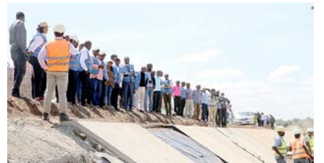
Maafisa kutoka National Irrigation Authority waungana na Katibu kukagua ujenzi wa mitaro.