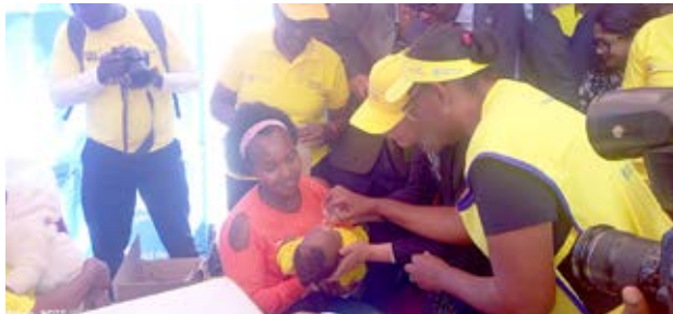
Mtoto apokea chanjo ya polio katika Ruiru Level 4 Hospital wakati wa uzinduzi wa kampeni ya kitaifa ya chanjo dhidi ya ugonjwa huo.

Waziri wa Afya Susan Nakhumicha alisema, hatua hiyo inakuja baada ya kuripotiwa kwa visa sita katika Kaunti ya Garissa, ambavyo vyote vina uhusiano na virusi vilivyogunduliwa katika nchi jirani. Alisema awamu ya pili