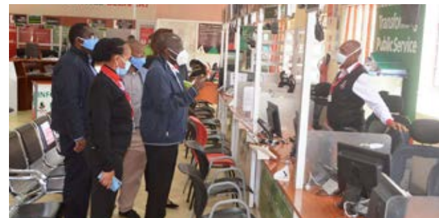
Wateja wapiga foleni kupokea huduma Huduma Centre

Afisa Mtendaji Mkuu alisema zaidi, "roho yetu ya ubunifu pia imekuja na mfano unaoitwa Business Process Outsourcing kupitia Huduma Kenya Agent mmoja anayeitwa BETA Agent amefundishwa na kuwezesha kutoa huduma kwa Wizara, Idara na Mashirika (MDAs) ambayo hayawezi kuajiri wafanyakazi kwenye vituo vyetu kutokana na vizuizi vya ajira, uhaba wa wafanyakazi, na dharura