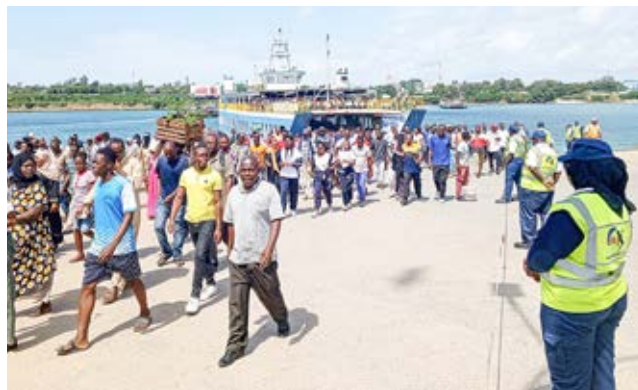
Abiria washuka kwenye feri ya MV Safari katika Likoni Crossing, Mombasa majira ya asubuhi.

"Utoaji wa huduma bora za feri unaendelea kuwa sehemu muhimu katika kuhamisha watu na bidhaa kati