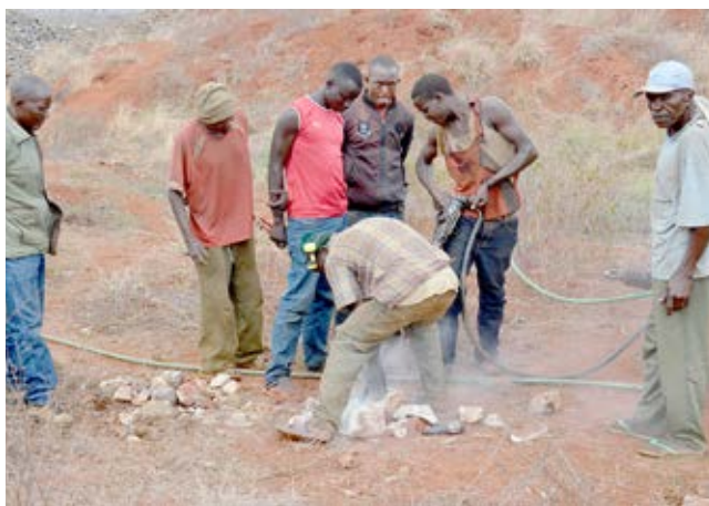
Wachimba migodi waingia ndani ya mgodi katika kaunti ndogo ya Mwatate.