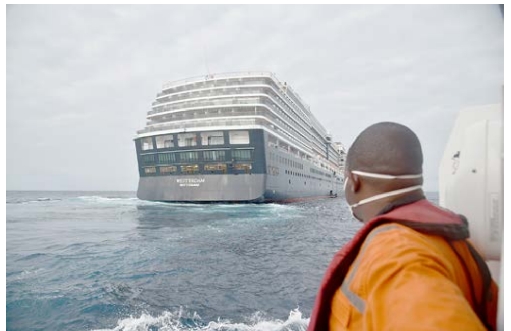
Meli ya kifahari ya MV. Westerdam

Alisema nchi sasa iko tayari kukidhi mahitaji mapya ya utalii kutokana na na ujenzi wa kituo cha kitalii cha mamilioni ya pesa katika Bandari ya