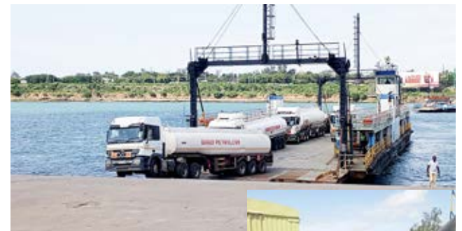
Magari ya kubeba mafuta yashuka kutoka feri ya MV Harambee katika kuvukio cha Likoni.

Tangu KPA ilipotwaa usimamizi, imechukua hatua kadhaa kupunguza msongamano na kuziba mianya ya kuvuja kwa mapato. Miongoni mwa mabadiliko yanayoonekana ni mfumo wa malipo kwa njia ya mitambo, milango ya kujifungua, na barabara zilizo-pambwa vizuri. Wakati wa masaa ya msongamano, feritano zinakuwa kazini. Uongozi umehamisha taratibu