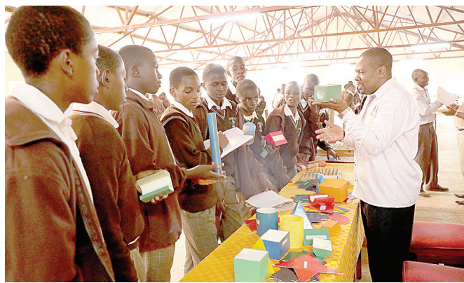
A trainer from Centre for Mathematics, Science and Technology Education in Africa (CEMESTEA) explains a concept to learners at Katoloni Secondary School during the mentorship and outreach programme on Science, Technology, Engineering and Mathematics (STEM) subjects.