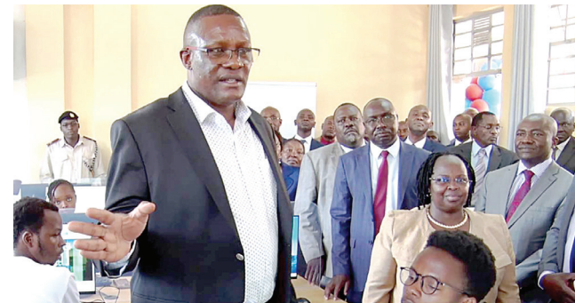
Information Communication and Digital Economy Cabinet Secretary Eliud Owalo during the launch of a Jitume Digital Lab at Thika Technical Training Institute in Kiambu county Thursday.