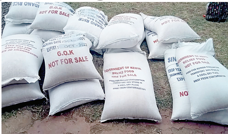
The government has allocated Sh. 2 billion for school feeding programme in Arid and Semi-Arid (ASAL) areas to help retain children in learning institutions.

The relief food will be distributed to vulnerable residents of Sericho, Gar-