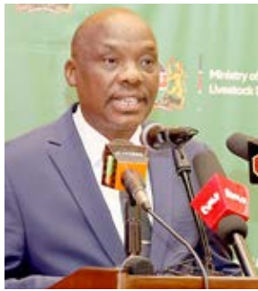
Naibu Waziri wa Kilimo Dkt. Kipronoh Ronoh aki-zungumza wakati wa mkutano na wanahabari jijini Nairobi mnamo Alhamisi, Mei 2, 2024.

Mkutano huo unatarajiwa kuwaleta pamoja wadau zaidi ya 2,000 kutoka barani kote ili kutathmini hali ya afya ya udongo barani Afrika, kujadili kuhusu jinsi masuala bora yanayohusu kilimo yana vyoweza kushughulikiwa, pamoja na kujihusisha na biashara katika hafla hiyo