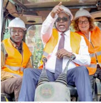
Waziri wa Kilimo na Maendeleo ya Mifugo Mithika Linturi wakati wa hafla ya uwekaji msingi wa maabara ya kisasa.

Linturi alisisitiza kuwa kutekelezwa kwa mradi huo ni muhimu kwa mageuzi ya kilimo