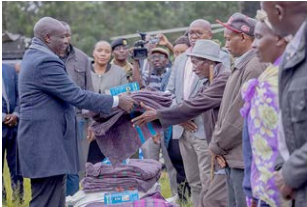
Naibu Rais aongoza ugawaji wa bidhaa za kibinafsi kwa waathiriwa wa maporomoko ya ardhi ambao wanalazwa katika Shule ya Msingi ya Ngutu huko Mathioya.

Akiongoza viongozi wengine kutoa chakula na