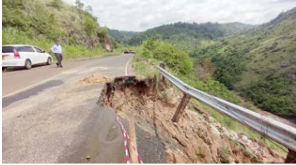
Sehemu ya barabara ya Murang'a - Kiriaini iliyoharibiwa na Mudslide wiki jana.

Kaunti ya Murang'a ina machimbo mengi katika kaunti ndogo tofauti, na katika siku za hivi majuzi, eneo hilo limekuwa likikumbwa na mvua kubwa. Wiki ya pili ya Aprili, chimbo moja katika eneo la Maragi liliporomoka na kuwajeruhi wachim-ba migodi wawili waliolazwa katika hospi-