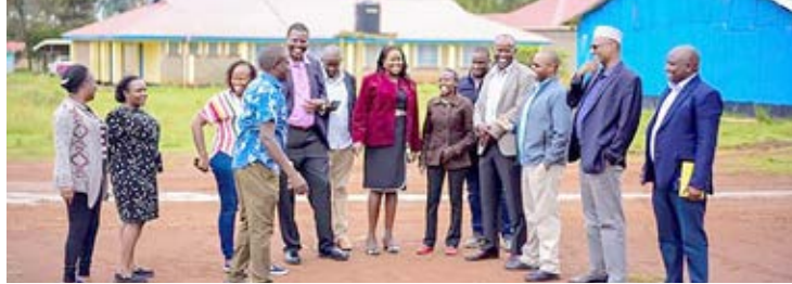
Maafisa wa serikali ya kaunti ya Uasin Gishu wakiandamana na kikosi kutoka KEMRI katika mojawapo ya vipande vya ardhi ambavyo vitazingatiwa kwa ujenzi wa kituo cha utafiti.

“Eldoret pia ni mwenyeji wa taasisi nyingi za elimu ya juu na ina idadi kubwa ya watu, mambo ambayo yanaiweka ki-