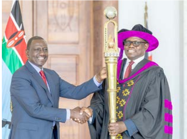
Machansela wawili wazinduliwa Ikulu wakati wa utoaji wa vibali kwa Chuo Kikuu kippya cha Tangaza na Chuo Kikuu cha Usimamizi cha Afrika.

kiel Machogu alitoa shukurani zake, akibainisha kuwa hii inajiri baada ya kuidhinishwa kwa chuo kikuu cha kwanza cha mtandao nchini Kenya - Open University. Machogu alisema kuidhinisha vyuo vikuu hivyo kunasisitiza kujitolea kwa rais