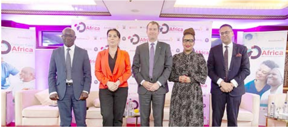
Wadau wa AstraZeneca wakipiga picha wakati wa uzinduzi wa Mpango wa Kansa Care Africa katika hoteli ya Nairobi