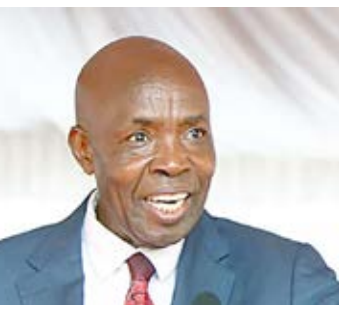
Waziri wa Fedha (CS) Ezekiel Machogu.