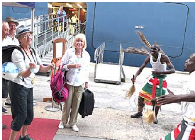
Watalii waliofika kwa meli ya MV Bollete wakiburudishwa na wacheza densi wa kitamaduni mjini Mombasa.