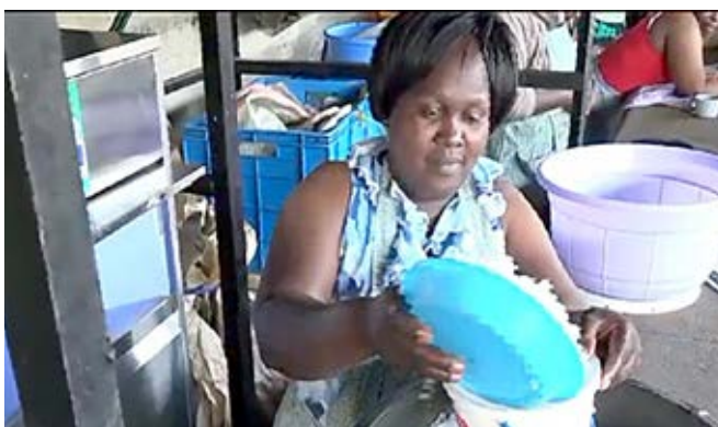
Mfanyabiashara katika Nakuru Top Market achota vipande vya barafu kutoka kwa mashine ya kutengeneza barafu iliyosakinishwa sokoni chini ya awamu ya pili ya Mpango wa Kusaidia Maendeleo ya Sekta ya Kilimo (ASDSP II)

Baadhi ya wafanyabiashara wa samaki wa Kaunti ya Nakuru wanat kila sababu ya kutabasamu baada ya kupokea mashine ya kutengeneza barafu iliyotolewa na serikali. Kikundi cha Reech Self Help Group kimeshuhudia kupungua kwa hasara kubwa baada ya kuvuna katika biashara yao ya samaki, kwani sasa wanazalisha barafu kwa ajili ya matumizi miongoni mwao na kuuzwa kwa wafanyabiashara wengine sokoni. Mashine ya kutengeneza barafu nje ya gridi ya taifa iliyofungwa kwa ushirikiano na Mpango wa Pili wa Kusaidia Maendeleo ya Sekta ya Kilimo (ASDSP) ya serikali ya kitaifa imewawezesha kuongeza akiba yao hadi kilo 1,200 kwa siku, kutoka chini ya 1,000 walizotumia. kwa hisa hapo awali. "Tumetatizika na biashara hii kwani tulikuwa tuki-