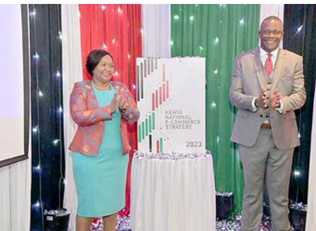
Ministry of Information, Communications and the Digital Economy (MICDE) Cabinet Secretary Mr. Eliud Owalo (left) accompanied by Cabinet Secretary, Ministry of Investments, Trade and Industry, Rebecca Miano during the launch of the E-commerce Strategy in Nairobi.