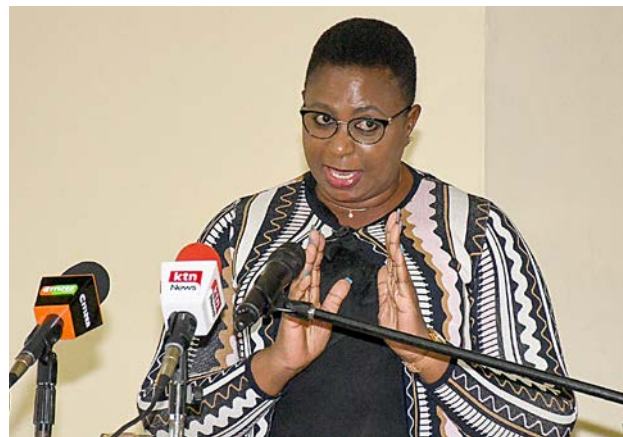
Aisha Jumwa, Cabinet Secretary Ministry of Public Service Gender and Affirmative Action.

Speaking at the Kenya School of Government