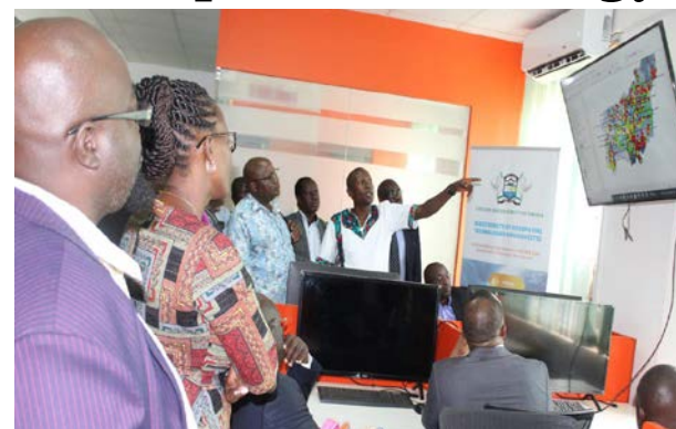
Visitors being shown images of Vihiga County at a Geo-spatial Information Systems laboratory.