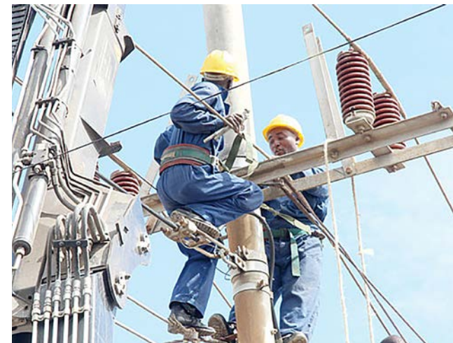
Kenya Power Engineers fixing a transmission line.

In the first phase of the Last Mile Project, the State had targeted 314,200 households, translating to 1.5 million additional Kenyans on the national grid. The project was estimated to cost Sh13.5 billion and was to entail the extension of low voltage network to