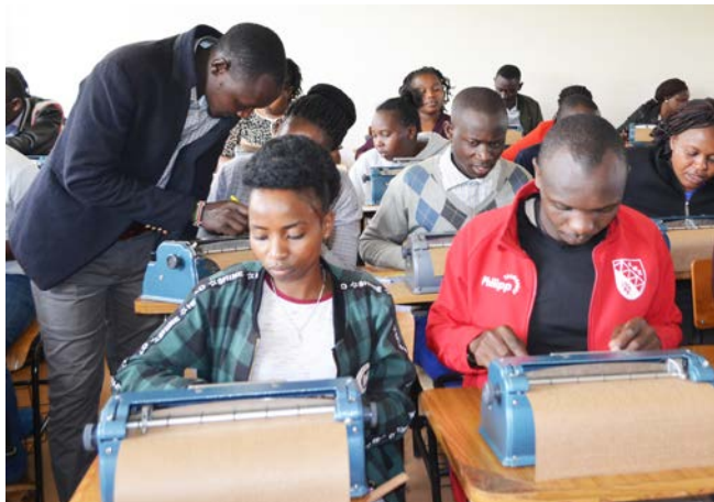
Teaching underway at the Distance Learning Centre at KISE in one of the Braille proficiency classes.

"My lesson plan and scheme of work are inside here," he says. With the tips of his fingers, he senses the propped up smooth-surfaced silver-coated pins