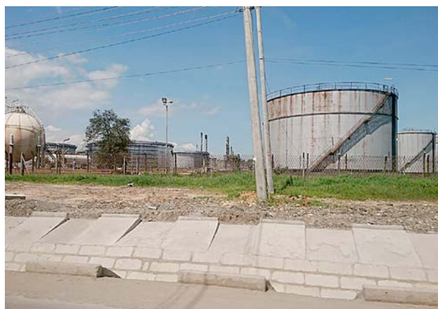
Kenya Petroleum Refineries tanks in Mombasa

"We will transform part of Line 1 from an oil pipeline