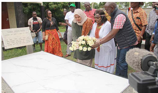
Cabinet Secretary Peninah Malonza (in white dress) laying a wreath on Tom Mboya's mausoleum.

Speaking after officiating the eleventh edition of Rusinga cultural festival in Homa Bay county, Malonza said the government was keen on ensuring tourist attraction sites in Lake Victoria was fully exploited.