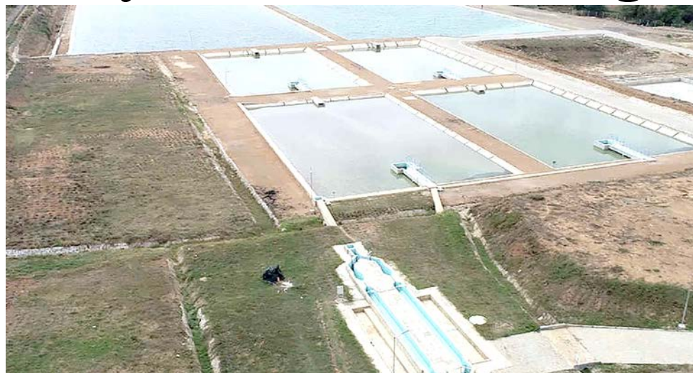
Aerial view of the Narok sewerage treatment plant

The construction of the Project, he said, began in the year 2019 and ended in December 2020, adding that it was the first project of its kind to be completed within the timelines, among the 22 on-going projects being undertaken by the Water