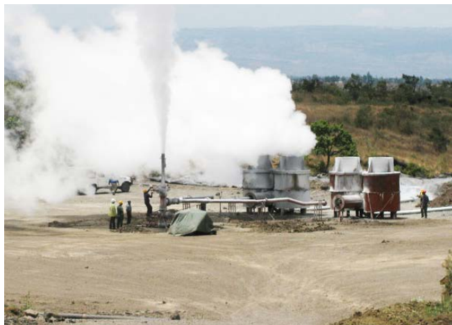
Clean power / A Geothermal well at Menengai Crater floor in Nakuru.

The IPP, alongside Sosian Menengai Geothermal Power and OrPower Twenty-Two